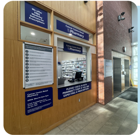
Picture 1: Cancer Centre Retail Pharmacy found on the 4th floor of GRRCC.

If you choose to use the stairs, you will see the CCRP to your left as you reach the top.